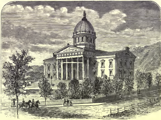
THIRD AND PRESENT STATE HOUSE AT MONTEPELIER.